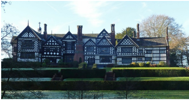
Bramall Hall dates back to the 14th century and was owned by the Davenport family. The house and gardens are open to the public.