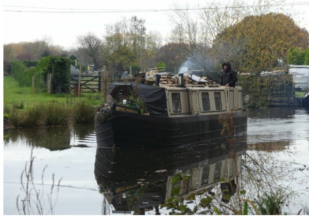
The Macclesfield Canal was built in the 1820s, at the end of the Canal Age, as railways were starting to take over, and hence had a relatively short working life. It runs from Marple to Hall Green near Kidsgrove.